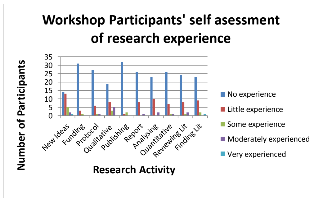
Figure Five: Workshop participants’ self-assessment of research experience

The results of participants’ self-assessments were entered and analysed using Microsoft Excel (Figure Five).